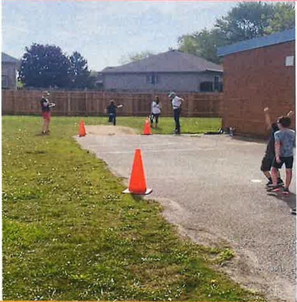
Running Long Jump